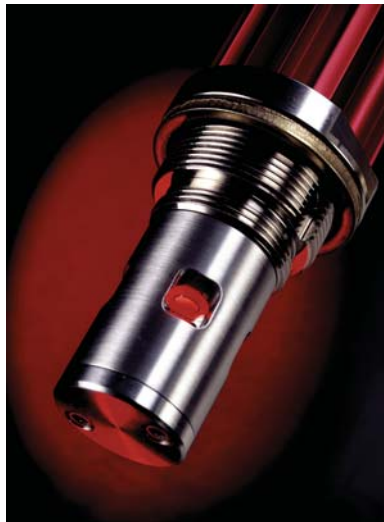
Optional 316 SS sensor housing for applications with high corrosives

A number of different corrosion resistant mirror and sensor housing materials are available, to withstand aggressive sample components in the harshest of applications. High temperature (up to